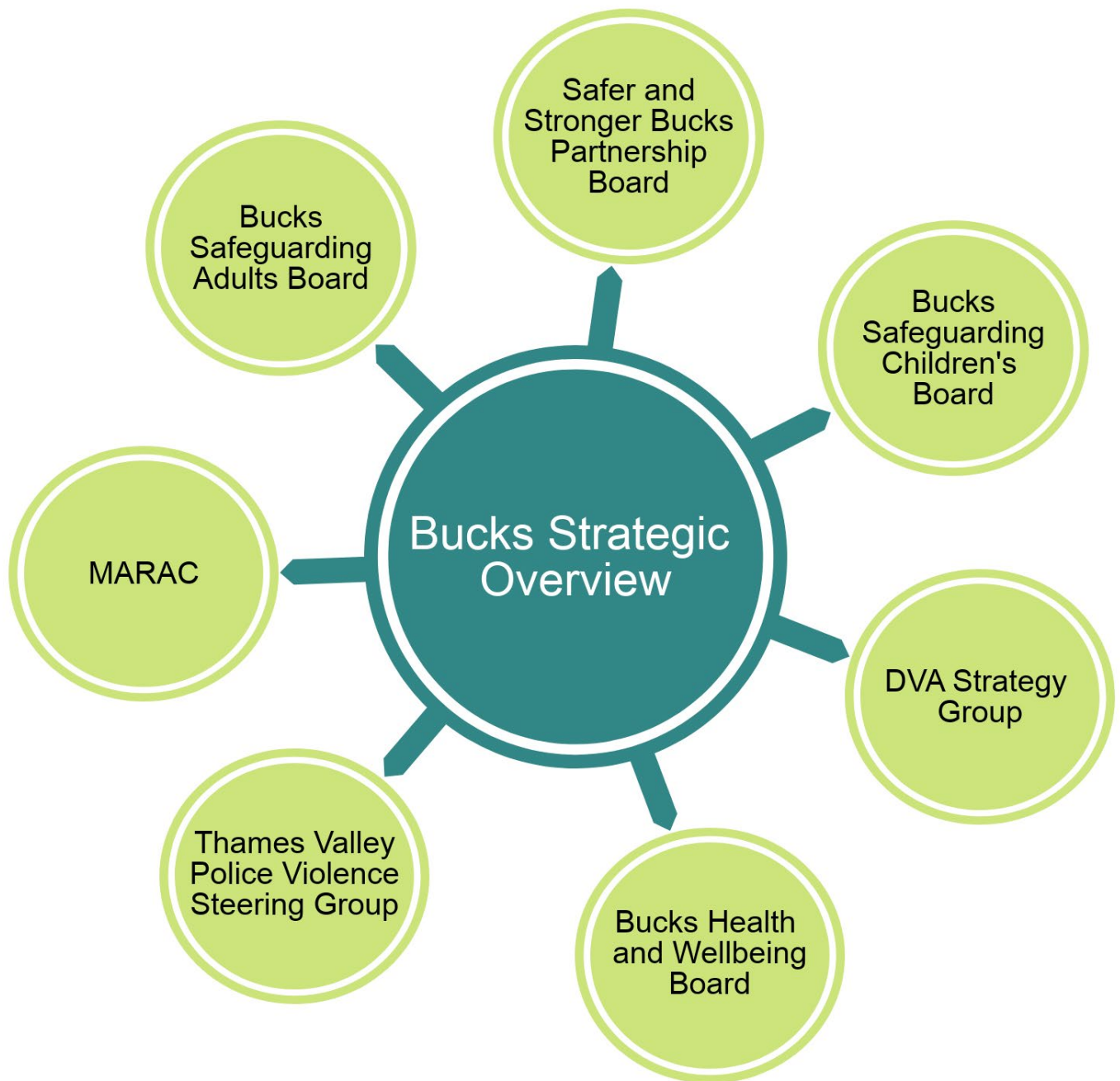
Figure 1: Boards linking the partnership's wider role around Safeguarding with governance around Domestic Abuse.